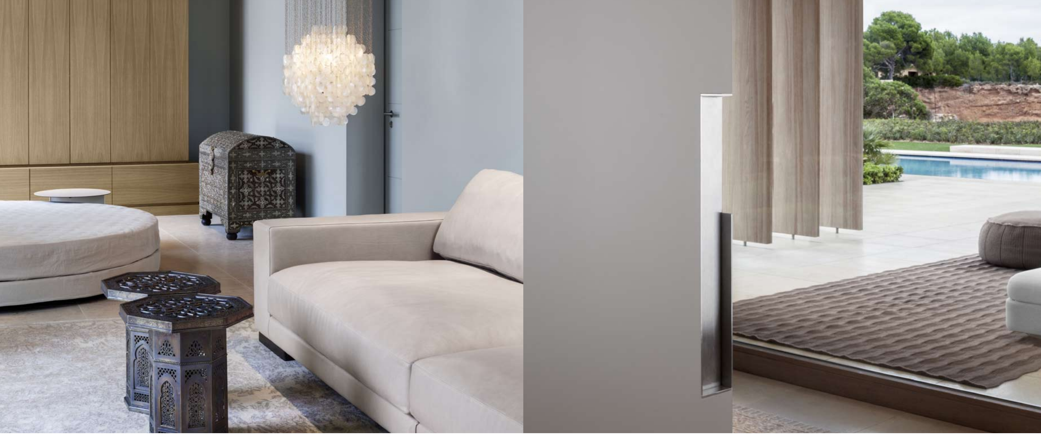
from left to right, from above to below: detail pool, built-in furniture, living area with view towards garden