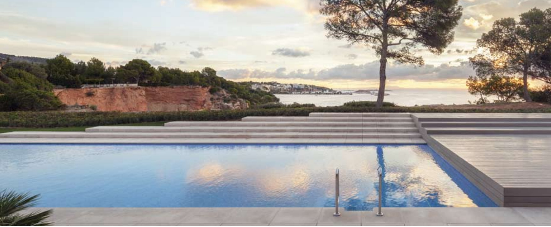
from above to below: outdoor dining area, garden with pool and view towards the harbor