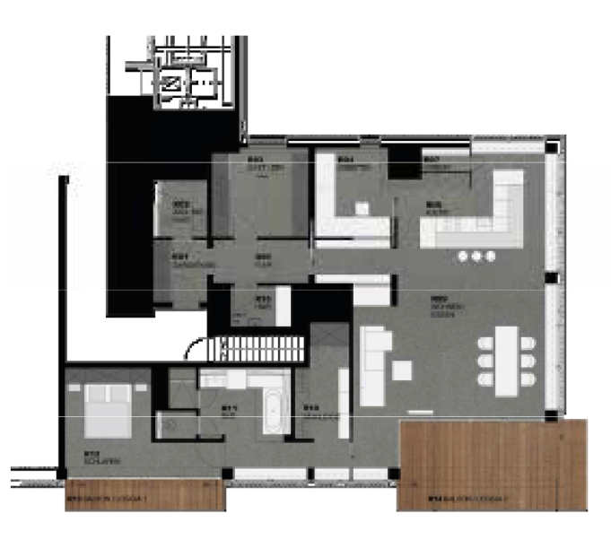
43 m² living 28 m² sleeping 28 m² kitchen 17 m² bathroom

The spatial boundaries of the existing apartment were dissolved in order to create a new structure with an open living and dining area at the heart of the space. With spectacular views on every side, the various spaces are all grouped around this central area. The interior design is characterized by the diverse views through the rooms and the optimal use of light. Connections between the rooms and the boundaries between one area and the next have become important design aspects. The layout plays with the different dimensions, with narrow passages leading the way and opening out into large rooms. These passages also offer additional storage space, tucked cleverly into the walls. The desire for privacy and quiet places of retreat is intertwined with communal and representative areas.